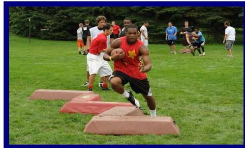
Campers working hard at LFG Football Camp OH (left).

The OH camp, which takes place each year at Otterbein University in Westerville OH, has seen more than 2,700 student-athletes participate over the last 7 years. More than 630 coaches have volunteered at the OH camp. The camp has featured 6 tremendous coaching professionals as its guest speakers through the years, all of whom have volunteered to join Lauren's First and Goal Honorary Board of Directors. Jim Tressel, then Ohio State Head Coach and now President of Youngstown University was the first featured guest speaker at the 2010 camp. Other guest speakers and Honorary Board Members include; Archie Griffin, Urban Meyer, Luke Fickell,