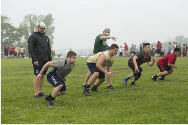
Student athletes participate in a drill at camp in PA (above).

While LFG receives necessary financial support in a variety of ways, the primary fundraisers of the Foundation are the football camps that run annually at the beginning of June in PA and OH. These camps demonstrate the coordinated efforts of hundreds of committed volunteers and are the basis of the success of the Foundation.