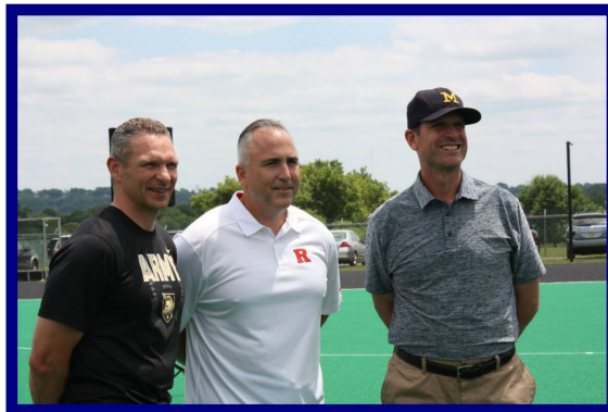
Army West Point Coach Jeff Monken, Rutgers Coach Kyle Flood, Michigan Coach Jim Harbaugh (from left to right).